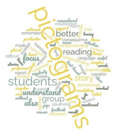
Image 7: Differences in learning outcomes with and without pictograms

Note. The image represents the data obtained from the second focus group question of the questionnaire taking in mind the words repeated. From Word Cloud Generator by Suarez Cindy, September 2024.